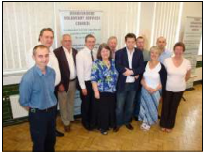
Alun Davies AM [middle front] with the voluntary sector representatives who attended the meeting on 5 June

As a result of this process DVSC is planning to establish a Rural Action Network for voluntary and community sector representatives. Further details to follow in future editions of this newsletter.