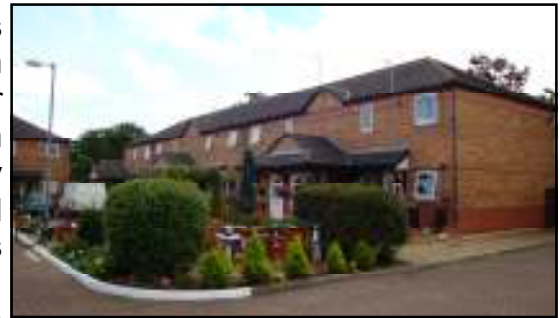
Buxton Court, Rhyl

This year the title of Denbighshire's Senior Citizens Estate of the Year has been awarded to Buxton Court, Rhyl. They will receive a cheque for £150.00. The second prize is shared between Llygadog, Corwen and Llys y Faner, Denbigh. They will both receive a cheque for £75.00. In equal third place with a cheque for £50.00 each are Wynne's Parc, Denbigh and Trem y Castell, Llangollen. Prize money in this category was donated by Cymdeithas Tai Clwyd.